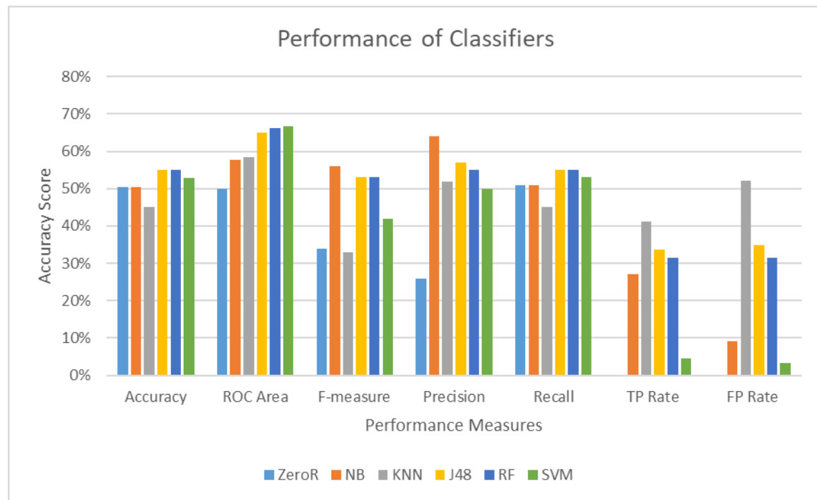
Fig. 2. Performance of classification algorithms.

The following shows the extent of improvement that occurred in the SA results. To verify the performance of the proposed hybrid SA model, Table 2 shows the results of the classification algorithms used in our proposed hybrid SA model, where it is related to the minimum term frequency, which is a key factor in the overall accuracy of the classifiers. For example, a word that is repeated the same number of the minimum term frequency; classifiers consider it a sentimental word. Using Weka, training the classifier on a set of labelled sentimental words is conducted. Then, testing the classifier on a new set of non-labeled sentimental words is also conducted to evaluate and validate the accuracy of the classifier.